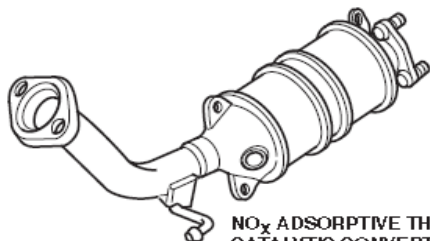
NO x ADSORPTIVE THREE-WAY CATALYTIC CONVERTER (ULEV) (DTC P1420 - '03 Models DTC P2000 - '04-05 Models) THREE-WAY CATALYTIC CONVERTER (SULEV) (No DTC set)

The other TWC is mounted under the floor to exhaust pipe B. The under-floor TWC is either a NO x adsorptive TWC (ULEV models) or a conventional TWC (SULEV models). If the NO x adsorptive TWC fails, it causes either DTC P1420 (NO x adsorptive catalyst system efficiency below threshold) to set in '03 ULEV models or DTC P2000 (NO x adsorptive catalyst system efficiency below threshold) to set in '04–05 ULEV models. There's no DTC set if the under-floor TWC fails in a SULEV model.